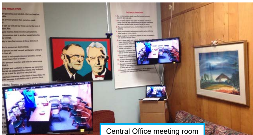
Central Office meeting room

It has been an interesting time for keeping up with A.A. meetings. We have all the meetings in the state on our website. This includes the Zoom meetings with a 'one click' join which allows you to join a Zoom meeting usually with a single click. The Website is created and maintained by Wilma L. Wilma has been doing this for 18 years now. You can update your meeting on the website using the ADD/UPDATE/DELETE A MEETING tab or by calling the Central Office at 501-664-6042. Please help us and the newcomer. We can't make corrections without your help. Don't send a newcomer to an empty room!